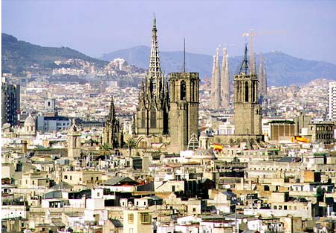
Barcelona's 'Old Cathedral' in the foreground, Gaudi's 'Sagrada Familia' in the back

Day 1 Overnight transatlantic flight from the United States to Spain (inflight meals) Aug 11 Thu