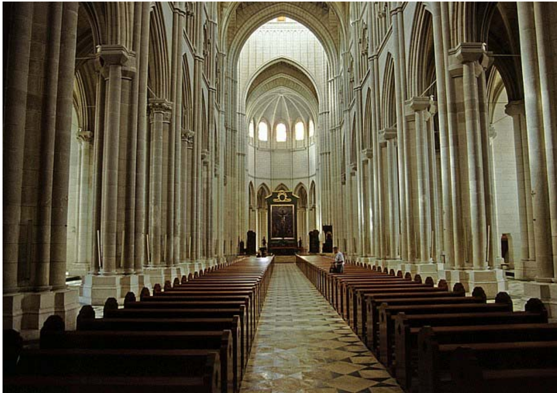
Madrid: Inside the Cathedral Nuestra Señora de la Almudena

The site on which Almudena Cathedral now stands was originally occupied by Madrid's first mosque, then by a church dedicated to one of Madrid's patron saints, Santa María de la Almudena.